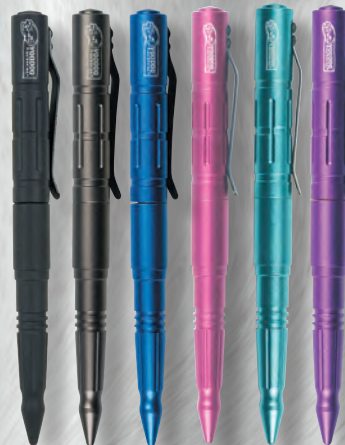
Self Defense Tool

Our CNC machined aircraft aluminum pens make an ideal gift at graduation or when that special someone is promoted. Overall Measures 6". Weighs .12 lbs. Available in six colors. Please specify color. #07-0153